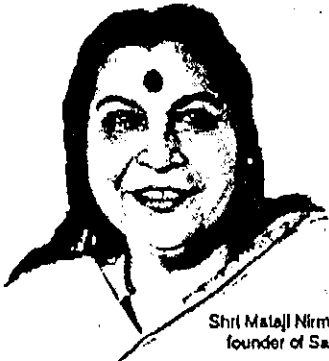
Shri Mataji Nirmala Devi - founder of Sahaja Yoga

"This is not a modern thing - It's an ancient accepted method of getting union with the Divine, which is Yoga. Described as the "Tree of Life" in the Bible, as "Asis" in the Koran ... "Kundalini" in Sanskrit - just like flowers on the tree of life at different times."