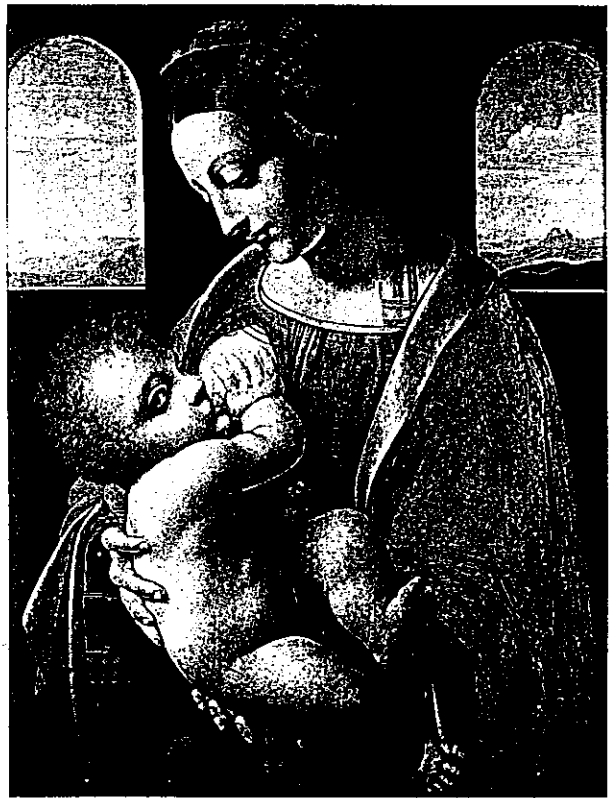
Plate 12 Litta Madonna, 1480 or 1485, tempera on canvas, 16 1/2" x 13", Hermitage, Leningrad