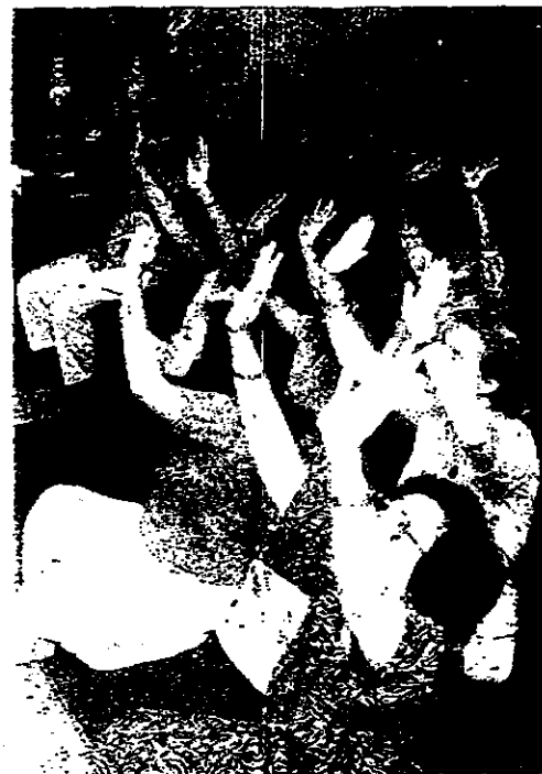
Sahaja devotees at the PJ centre going through a 'self-realisation' exercise.

"You can even test out scriptures. Some argue that