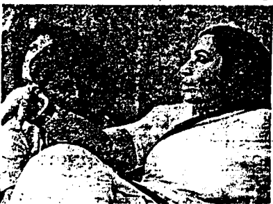
la «madre divina», Shri Mataji Nirmala Devi.

Secondo testimoni Shri Mataji riesce persino a creare arcobaleni